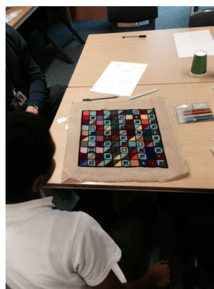
Children in 1-1 Maths puzzling over a number square...or is it?

We look forward to a busy half term, look out for dates of parent workshops coming soon.