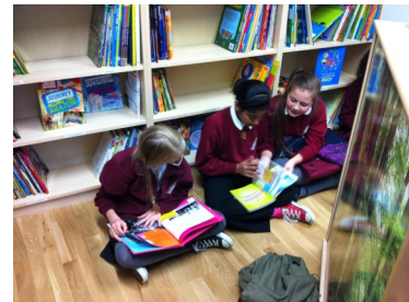
Last Year's year 6 children enjoying books in our Brand