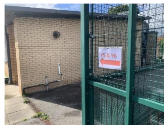
Follow path round EYFS