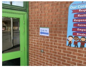
Head to playground door