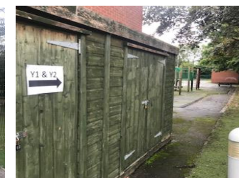
Pass sheds to classrooms.