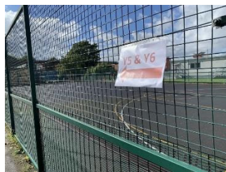
Pass Muga pitch then turn right