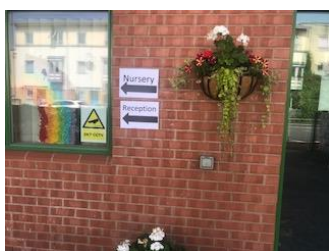
Turn left to car park.