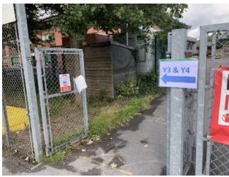
Through Shearsby Close gate