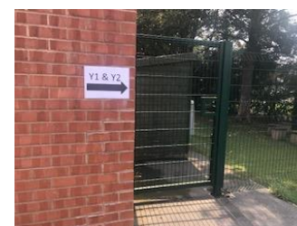
Head to KS1 back gate