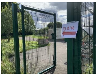
Through Clopton Walk gate