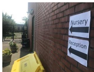
Turn right at car park.