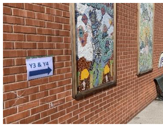
Pass the mosaics