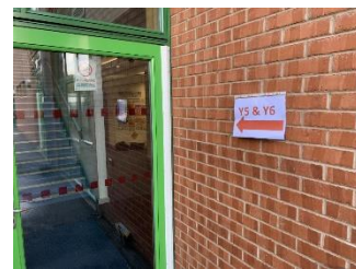
Head to dining room door

Staggering entrance/collection times will help adults and children distance appropriately and will reduce the risk of children coming into contact with children from other bubbles.