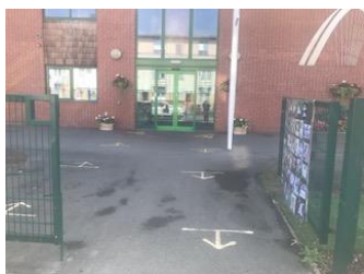
Through main gate.