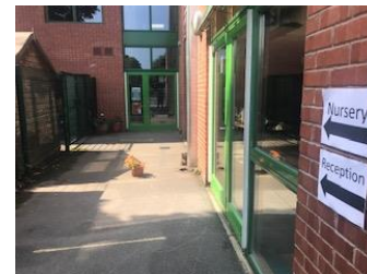
Head to EYFS gate.